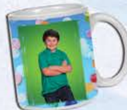
Pkg. 3 Coffee Mug