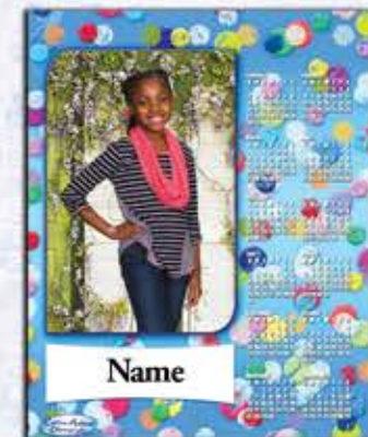
Pkg. X Calendar Magnet