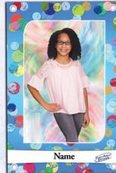
Pkg. S 2ft. x 3ft. Vinyl Banner