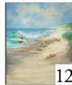
12 Coastal Beach