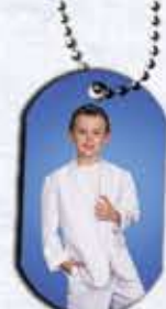
Pkg. R Dog Tag (No Name)