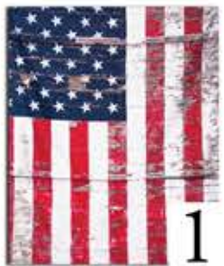
1 Red, White, & Blue