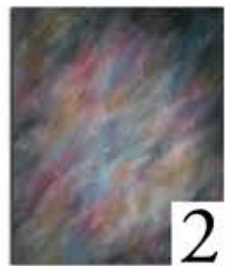
2 Old Master