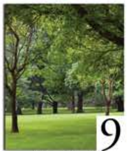
9 The Park