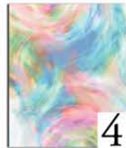
4 Pretty Pastels