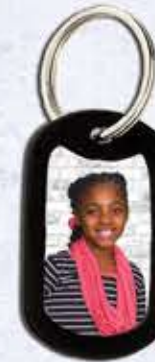
Pkg. 8 Dog Tag Keychain (No Name)