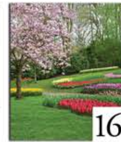
16 Tulip Garden