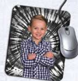
Pkg. Q Mouse Pad (No Name)