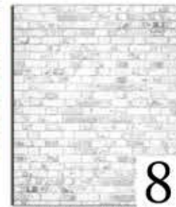
8 White Brick