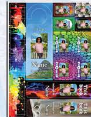
Pkg. 2 Funpack (12-Items)