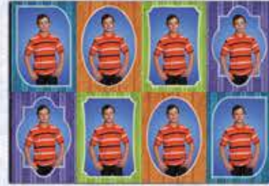
Pkg. T 8-wallet magnets (No Name)