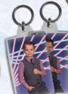
Pkg. 1 2-Key Rings