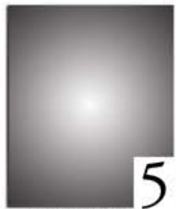
5 Fashion Gray (DEFAULT)