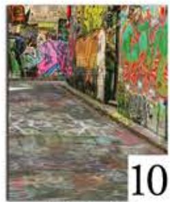
10 Urban Art