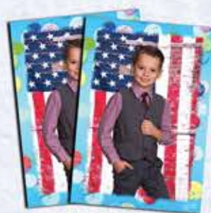
Pkg. Y 2-3.5x5 Magnet Prints (No Name)