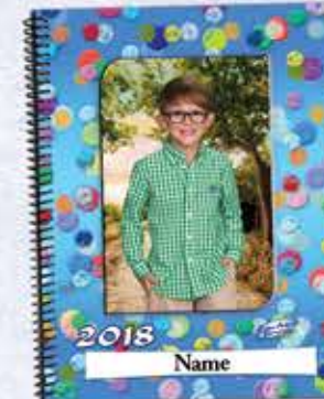
Pkg. V Notebook