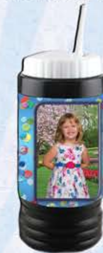
Pkg. 4 Water Bottle