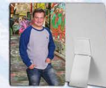
Pkg. Z 4x6 Metal Print (No Name)