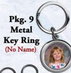
Pkg. 9 Metal Key Ring (No Name)